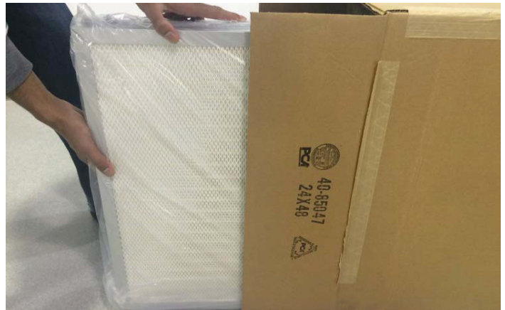
B) REMOVE FILTER FROM BOX BEING CAREFUL NOT TO TOUCH FILTER MEDIA.