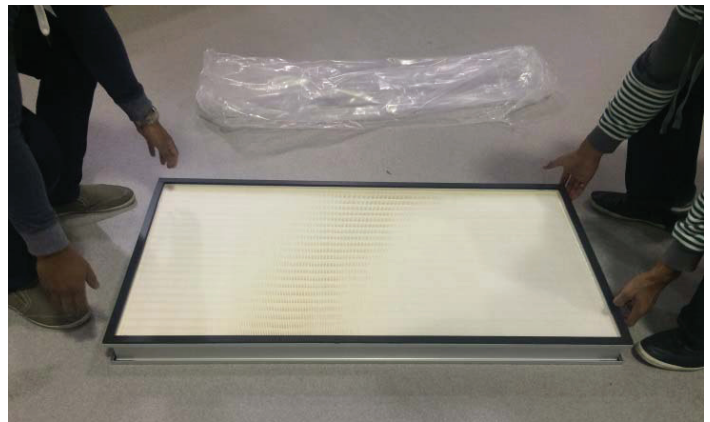
D) PLACE FILTER ON A FLAT, CLEAN, PROTECTING SURFACE WITH THE EXPANDED FACE SCREEN ON THE BOTTOM.