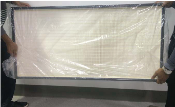
C) PLACE THE FILTER GENTLY ON THE FLOOR, REMOVE THE TAPE, AND TAKE THE FILTER OUT OF THE BAG.