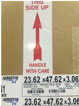
A) PLACE FILTER BOX ON FLOOR, CAREFUL TO SET BOX IN CORRECT ORIENTATION, AS PER THE ARROW.